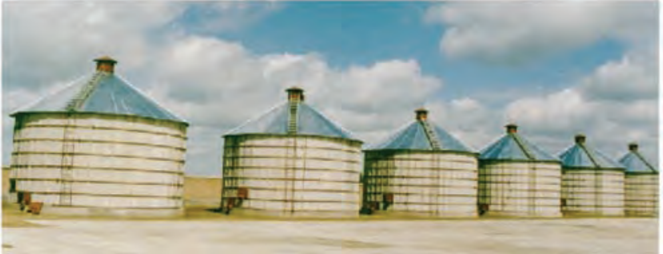
Figure 6 - GRC grain silo

With the reform of the grain distribution system going further, grain requirements have changed from a shortage to surplus. The GRC product is accepted by the relevant grain administration department for its excellent properties of light weight, high strength and anti-damp characteristics, which is most suitable for making grain silos. The GRC grain silo is widely used in the main producing areas in north China, such as Jilin and Heilongjiang, and it has large application potential in the market.