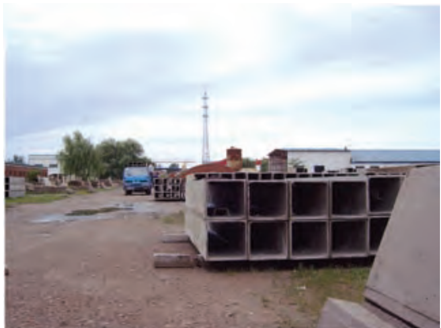
Figure 5 - The ventilation pipes made from low-alkali SAC from Tangshan Liujiu Cements Ltd