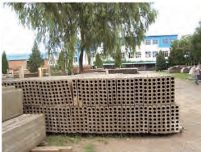
Figure 3 - GRC exterior decorated components made from SAC of Tangshan Liujiu Cements Ltd

At present, GRC products have been used widely in decorated architectural components and artwork in many areas such as Beijing, Shanghai, Dalian and Tianjin. Beijing Baogui Artificial Rock Art and Technology Ltd is a typical company which makes GRC sculptures and decorates many important places such as the Diao Yu Tai Hotel, the Great Hall of the People and so on. Hundreds of companies such as Shanghai Ningshi Building Materials and Engineering Company and Dalian Dapengda Decorated Ltd have used GRC products to make various European- or Chinese-styled exterior decorated components. These components are widely used for many top-grade residence blocks and villas. This market is increasing and has developed at a rapid rate because of the low price and excellent durability compared with that of gypsum products and glassfibre reinforced plastic products.