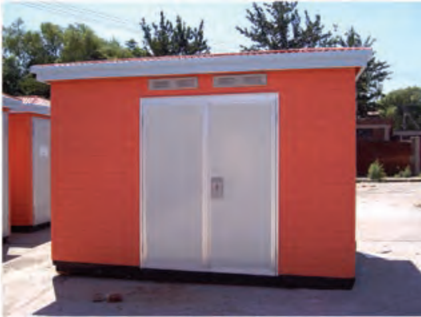
Figure 8 - GRC transformer room produced using SAC from Tangshan Liujiu Cements Ltd

Tangshan Liujiu Cement Ltd is producing rapid-hardening and composite cement, which is used for making drainpipes. Products are introduced in large volume in north China due to the features of rapid hardening and high early strength. The main advantages are saving demoulding time, high strength, short curing time, fast turnover of the mould, and increasing the work efficiency. At present, the demand of large-diameter drainpipes is increasing with the growth of a large amount of infrastructure construction. As the yield efficiency is increased to a large degree, and the strength is very high, it wins the good opinion of the customers.