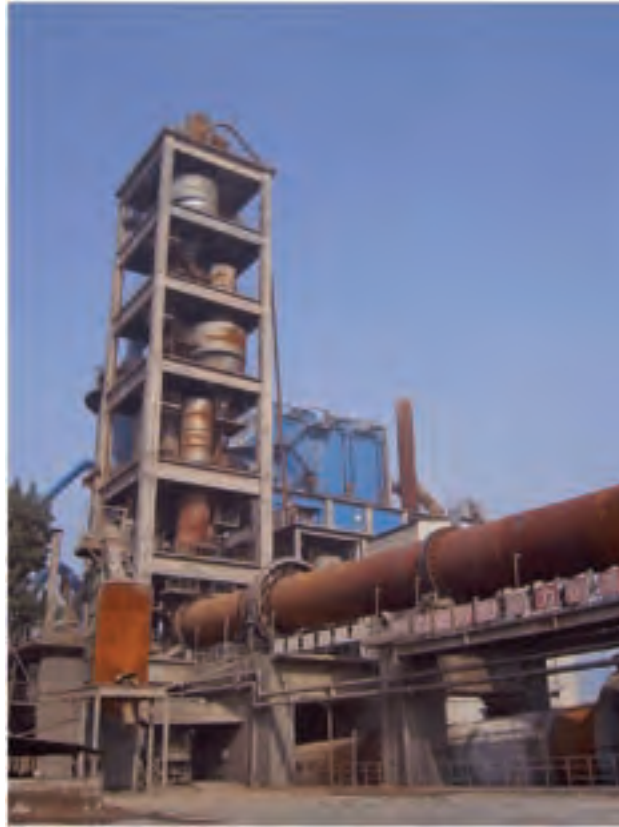
Figure 1 - Product line of Tangshan Liujiu Cements Ltd

The physical properties of SAC produced by Tangshan Liujiu are shown in Tables 1 and 2.