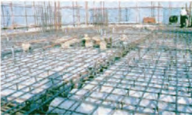
Figure 7 - GRC light-wall conduit produced using SAC from Tangshan Liujiu Cements Ltd

It is always a difficult problem to make wide-span roof materials in Chinese construction. The GRC mushroom floor could solve the problem to some extent. Putting small-diameter GRC pipe (diameter 100~200 thickness 5~7mm) together, then pouring fine aggregate concrete to construct the overall structure, it solves the problem of wide-span construction. GRC mushroom floors bring great convenience to the roof construction of large theatres or sports complexes, gymnasiums, restaurants and other entertainment places. It is widely appreciated with the low cost that the market share is going up at present.