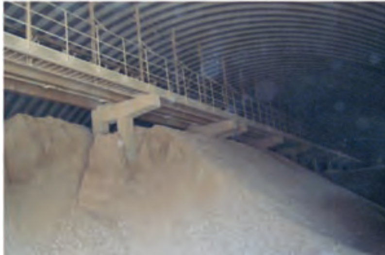
Figure 2 - Pre-homogenising stockpile by mechanical power in Tangshan Liujiu Cements Ltd