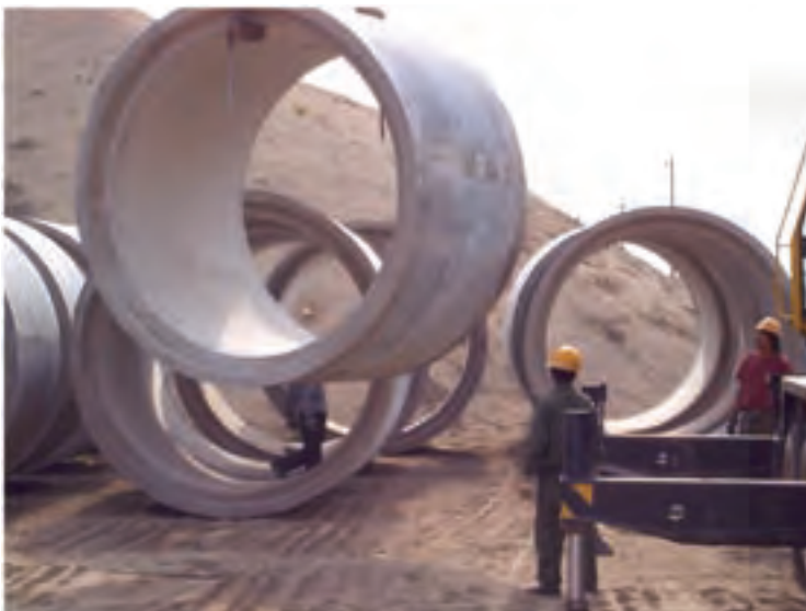
Figure 9 - GRC drainpipe produced using SAC from Tangshan Liujiu Cements Ltd

Tangshan Liujiu Cement Ltd is producing rapid-hardening and composite cement, which is used for making drainpipes. Products are introduced in large volume in north China due to the features of rapid hardening and high early strength. The main advantages are saving demoulding time, high strength, short curing time, fast turnover of the mould, and increasing the work efficiency. At present, the demand of large-diameter drainpipes is increasing with the growth of a large amount of infrastructure construction. As the yield efficiency is increased to a large degree, and the strength is very high, it wins the good opinion of the customers.