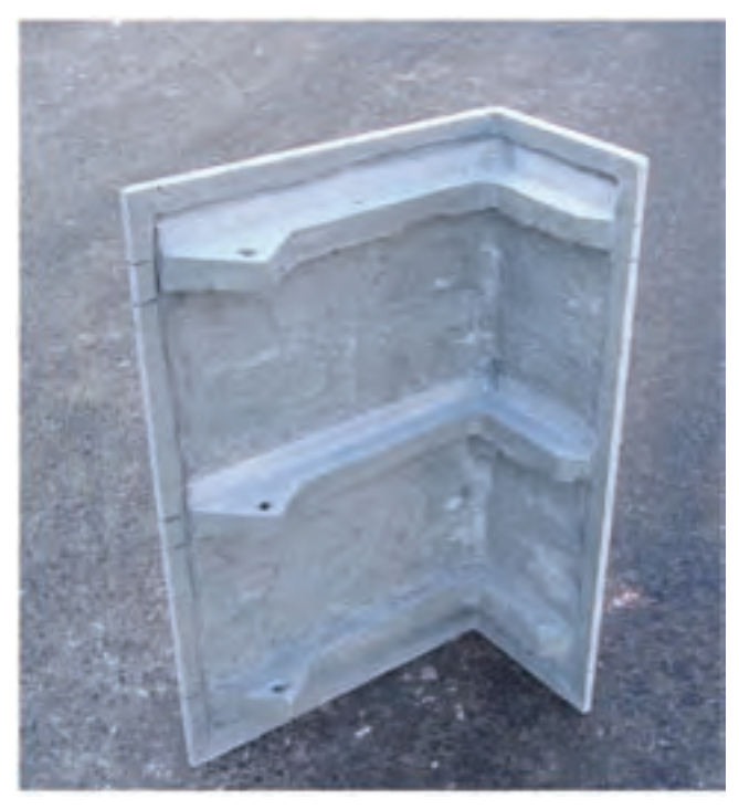
Figure 6 - GRC lost formwork of the composite test cornice