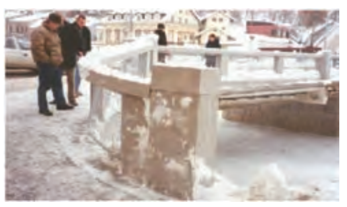
Figure 3 - Bridge in Vsetín with GRC lost formwork of parapets imitating natural granite