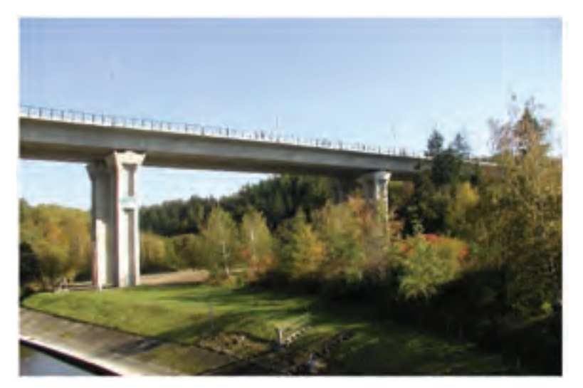
Figure 1 - Bridge in Plzeň with GRC lost formwork of pier heads